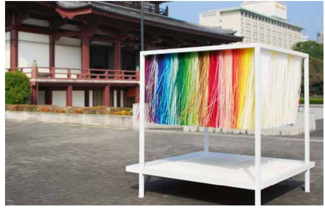
Emmanuelle Moureaux, I am here , 2016 and 100 colors in 3.3m² , 2017 (pictured). Japan.