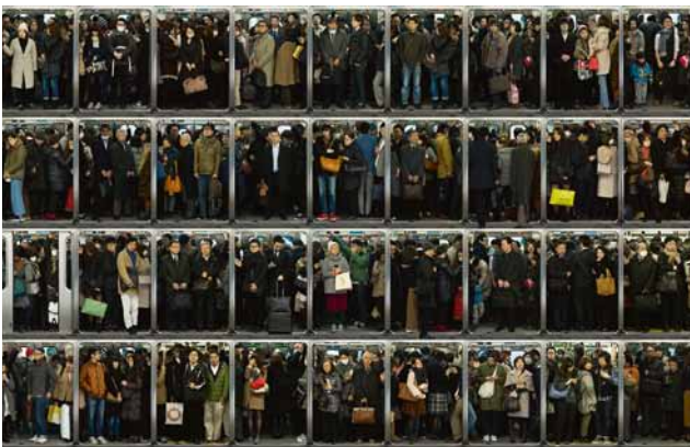
Julio Bittencourt, Tokyo Subway (pictured) and Capsule Hotel , 2015 / 2016. Brazil. Courtesy of Aesthetica Art Prize and the artist.