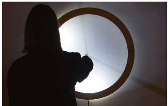
breadedEscalope, Shadowplay , 2015. Austria.